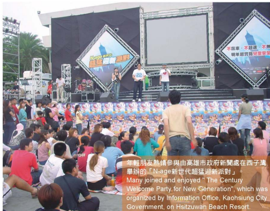
年輕朋友熱情參與由高雄市政府新聞處在西子灣舉辦的「N-age新世代超猛迎新派對」。Many joined and enjoyed "The Century Welcome Party for New Generation", which was organized by Information Office, Kaohsiung City Government, on Hsitzuwan Beach Resort.

( http://www.kcg.gov.tw/~kcginfo ) 下載報名表，或致電詢問，請聯絡高雄市新聞處第三科，電話：(07) 3315016