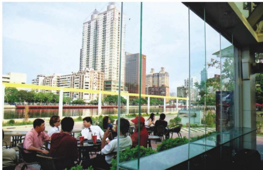
愛河盼迷人的景色。 Enchanted views along Love River

Come! Let's wander around with fragrant coffee and melodious music. Let the lively Love River guide you through an abundant journey.