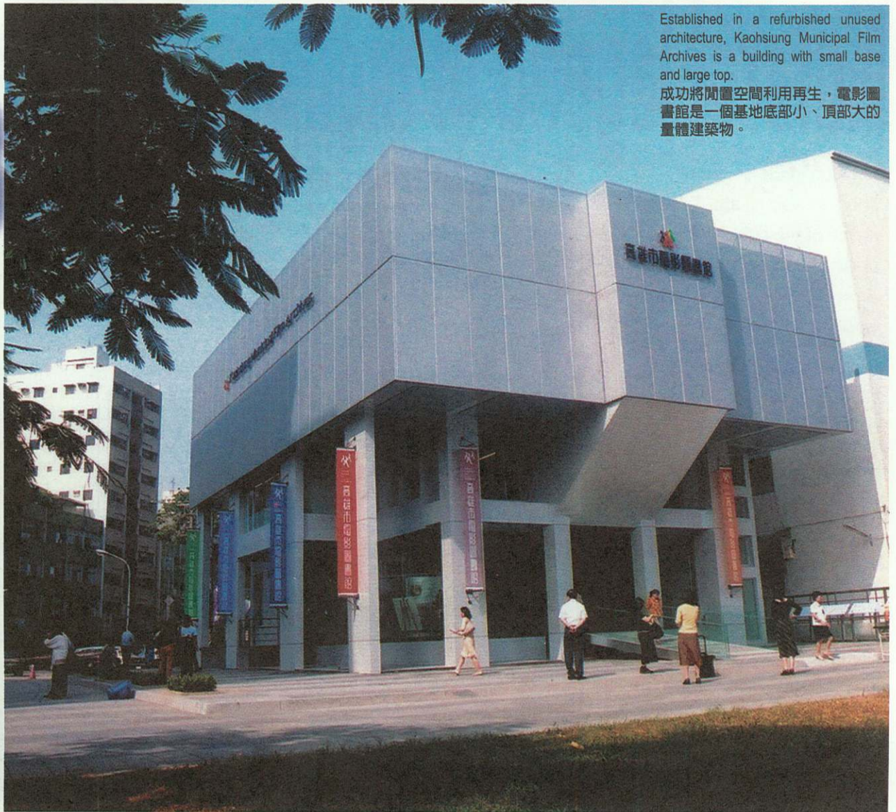
Established in a refurbished unused architecture, Kaohsiung Municipal Film Archives is a building with small base and large top. 成功將閒置空間利用再生，電影圖書館是一個基地底部小、頂部大的量體建築物。