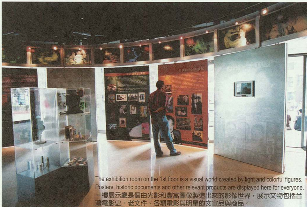
The exhibition room on the 1st floor is a visual world created by light and colorful figures. Posters, historic documents and other relevant products are displayed here for everyone. 一樓展示廳是個由光影和豐富圖像製造出來的影像世界，展示文物包括台灣電影史、老文件、各類電影與明星的文宣品與商品。

未來，電影圖書館就像它的建築物所發出的光芒一樣，無論是在文化電影使命或社區營造，都是一個熠熠的發光體，吸引著各方的朝聖者。