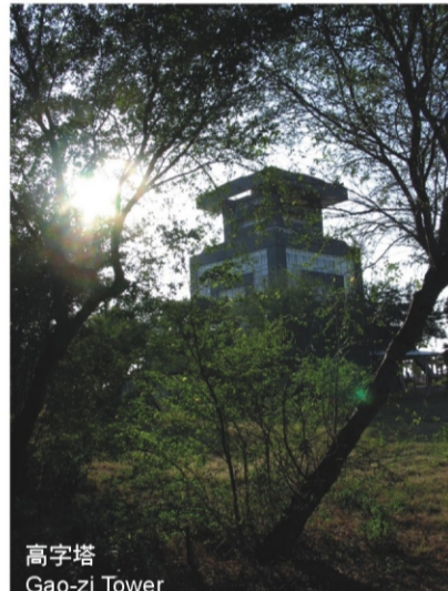
高字塔 Gao-zi Tower

People who like seaports should not miss this excursion. The