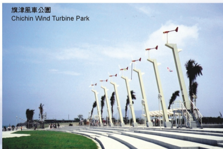
旗津風車公園 Chichin Wind Turbine Park

交通指南：搭1線公車到鼓山輪渡站班次密集。順著旗津海岸往南到遊客中心的出口是旗津三路，這邊的35線公車是返回旗津輪渡站的單向車，所以必須直穿過旗津三路到中洲三路搭乘南向的35線公車到