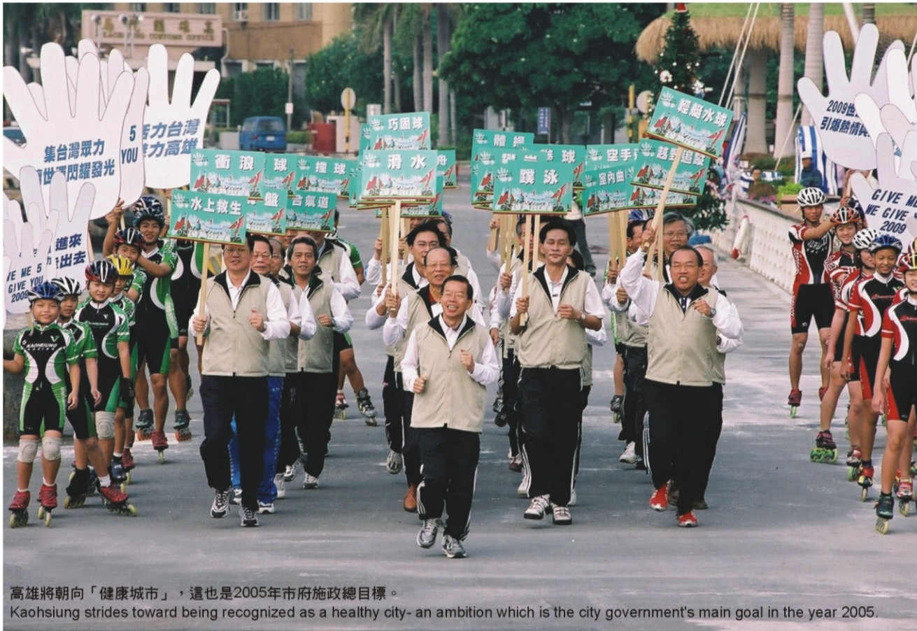
高雄將朝向「健康城市」，這也是2005年市府施政總目標。 Kaohsiung strides toward being recognized as a healthy city- an ambition which is the city government's main goal in the year 2005.