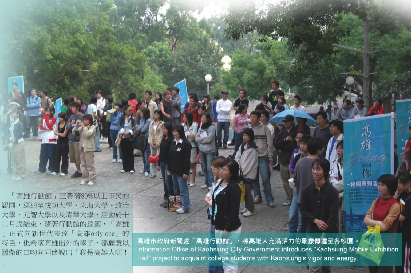
高雄市政府新聞處「高雄行動館」，將高雄人充滿活力的景象傳達至各校園。Information Office of Kaohsiung City Government introduces "Kaohsiung Mobile Exhibition Hall" project to acquaint college students with Kaohsiung's vigor and energy.