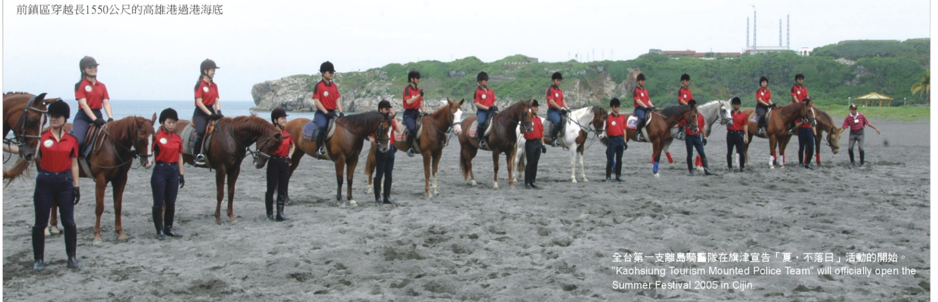
全台第一支離島騎警隊在旗津宣告「夏·不落日」活動的開始。 "Kaohsiung Tourism Mounted Police Team" will officially open the Summer Festival 2005 in Cijin.

而在愛河畔舉行的「永浴愛河」活動，則是從8月5日至8月14日每天浪漫登場，有拉丁風情、50、60、70年代的老情歌，爵士樂等，陪伴民眾永浴愛河。