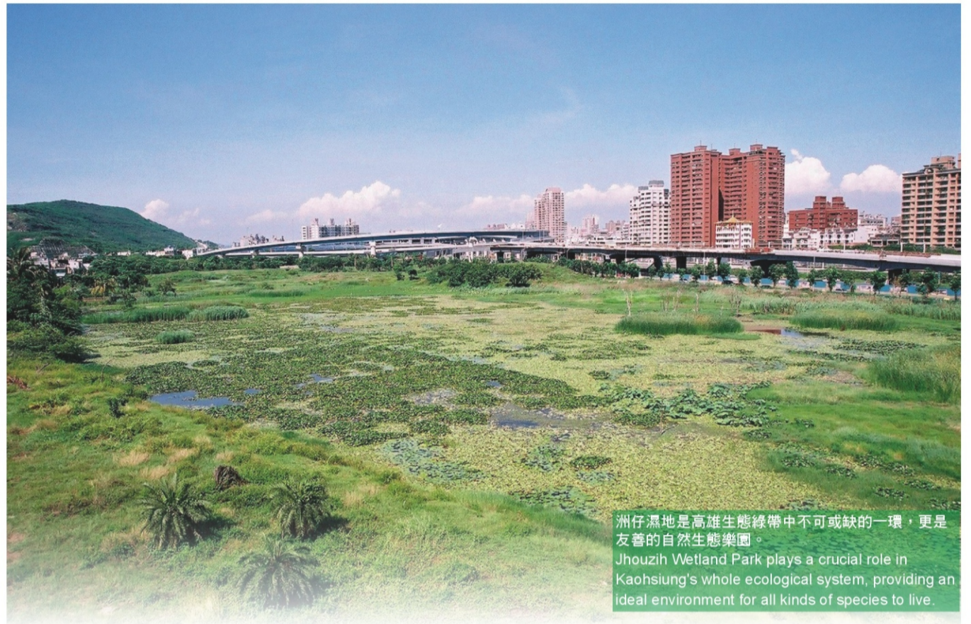
洲仔濕地是高雄生態綠帶中不可或缺的一環，更是友善的自然生態樂園。 Jhouzih Wetland Park plays a crucial role in Kaohsiung's whole ecological system, providing an ideal environment for all kinds of species to live.

Situated to the East of Lotus Lake, Jhouzih Wetland Park plays a crucial role in Kaohsiung's whole ecological system. The extensive wetland park covers 10 hectares, with an extensive number of different species, such as water insects, fish, reptiles and birds. The area also includes 3 hectares water caltrops, ponds and forest.