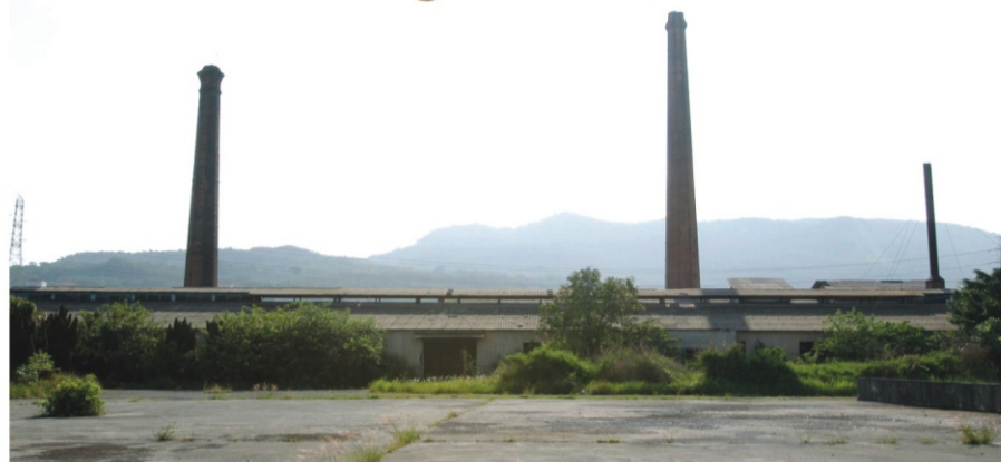
市政府計劃重新整修中都磚窯場周邊的環境，吸引民眾到中都地區來走走。Kaohsiung City Government planned to renovate the surrounding area in order to attract visitors to stroll in the Chungtu Area.

Chungtu Tangjung Brick Kiln Factory, located at the section of Love River that runs through Chungtu, is regarded as a key factor