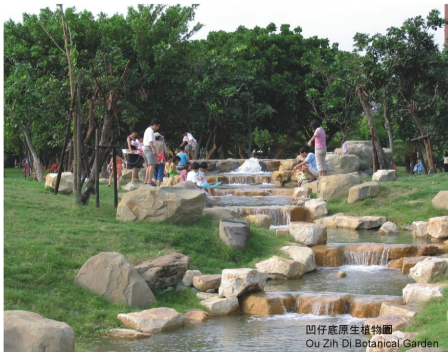
凹仔底原生植物園 Ou Zhi Di Botanical Garden

在青斗石鋪面的歷史景觀步道上漫步，欣賞路旁傳統建築物的紅瓦厝，讓人有思懷古趣的情懷，景觀步道也散發出歷史的光輝。