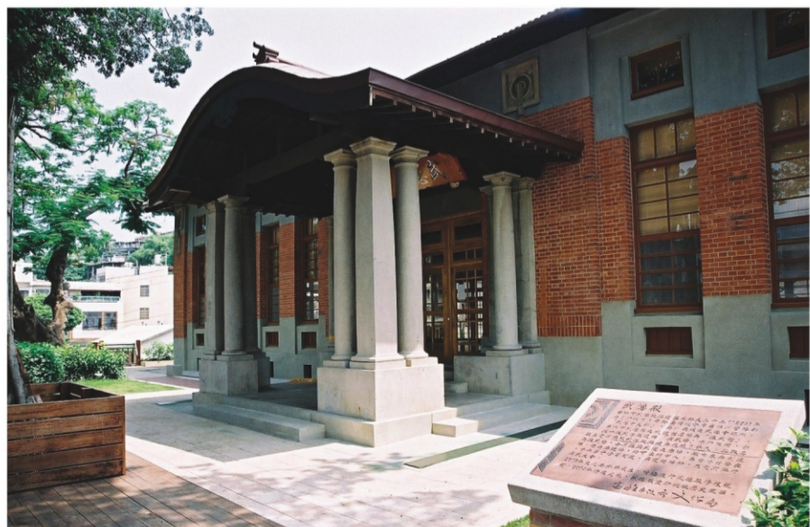
武德殿在翻修後，不僅呈現嶄新的風貌，也將規劃成為一個藝文表演場所。After renovation, Wuteh Hall has now has a fresh new look; in the near future, it will become a base for the performing art.

領事館」方式委外經營，希望能成為一個藝文表演的場所，給予古蹟活化更多不同的模式。