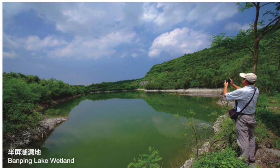
半屏湖濕地 Banping Lake Wetland

愛河濕地位於高雄市愛河南側十全路與九如路間，緊鄰同盟三路與九如截流站的愛河河段，濕地引入河水，水位隨愛河的潮汐變化而升降，營造一處水陸交界生物多樣