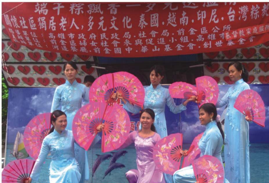
新移民家庭服務中心舉辦活動慶祝佳節 The center holds activities and holiday celebrations

At the New Immigration Family Center, people chat in different languages and read foreign and local magazines. The center offers strong