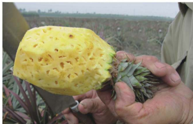
有機鳳梨吃起來更甜、香氣更飽滿，還有入口即化的綿密口感。 Organic pineapples are sweeter, more fragrant and have a silky texture.