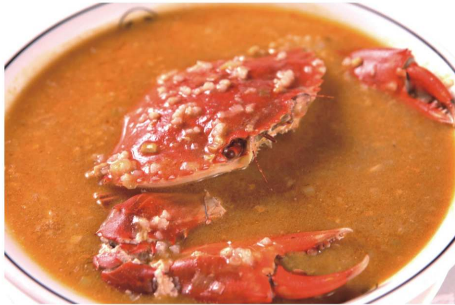
蟳之屋 House of Crab

dish. Made with hand-picked "virgin crabs" (female crabs that have never laid eggs) sauteed with garlic and scallions and simmered in rice. The dish is cooked slowly until it reaches a soupy consistency and is transformed into golden deliciousness. Another signature dish is Golden Pumpkin Rice Noodle. The rice noodles are cooked al dente style and accentuate the sweetness of the pumpkin. Thick, rich flavorful giant dried shrimps unique to Penghu are also added. This combination of flavors will leave you wanting for more.