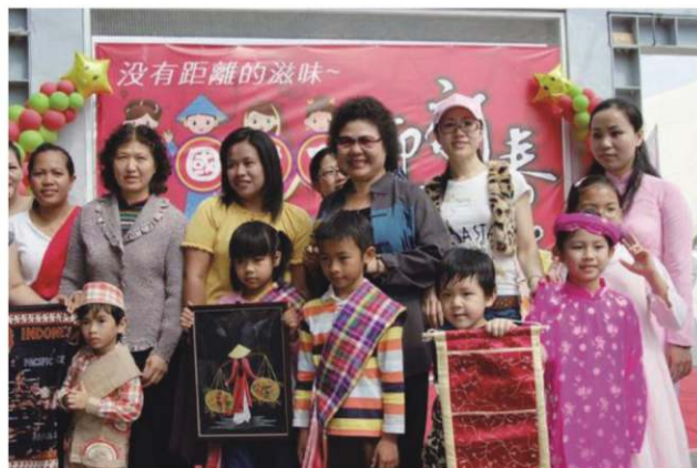
陳市長與新移民一同歡度農曆新年 Mayor Chen celebrating Chinese New Year with Kaohsiung's immigrant women

Add: No. 209, Zhongheng 4th Rd., Cianjin District, Kaohsiung City TEL: 07-2155335