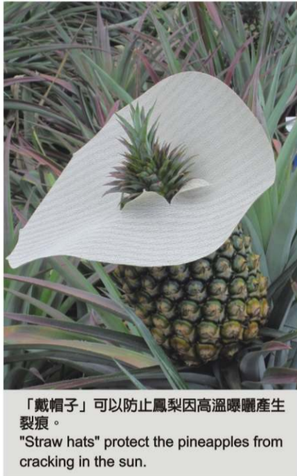
「戴帽子」可以防止鳳梨因高溫曝曬產生裂痕。 "Straw hats" protect the pineapples from cracking in the sun.