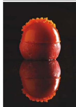
珠寶美食套餐讓料理展現出有如珠寶的色彩與光澤。 Colorful cuisine designed to resemble jewelry.

partnering jewelry designers and pastry chefs. The goal was to create glittering, colorful jewelry and deserts. This became a multi-sensory exhibition, turning a cuisine into a cultural experience.