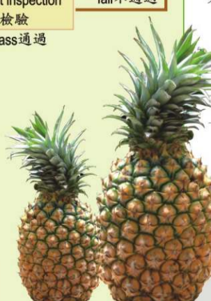
有機認證的鳳梨 Certified organic pineapples

鳳梨伯說吃鳳梨會健康，也許是每天吃10台斤鳳梨累積的功力，鳳梨伯看起來相當勇健而且精神抖擻。每顆鳳梨從無到有，需要2年的細心培育，問起種植鳳梨的辛苦，鳳梨伯只是淡淡地說：「手會粗粗的。」鳳梨伯也不是一開始就這麼順利，曾經因為種植的土壤不佳，產出口感偏酸的鳳梨，慘賠400萬。越挫越勇的鳳梨伯培育出通過有機認證的鳳梨，飽滿的香氣和入口即化的綿密口感，鳳梨的甜和香，加上不咬舌，讓吃過的人都豎起大拇指說：「讚！」鳳梨伯的有機鳳梨品質廣受好評，他希望打開有機鳳梨的銷售通路，目前除固定每週六在高雄縣「微風市集」販售，也提供宅配到府的服務。