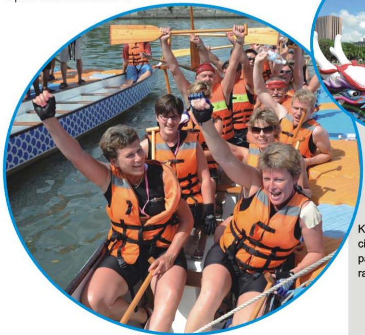
高雄市的姐妹市阿姆斯特芬市組團參加龍舟賽，並承諾明年還要再來！ Kaohsiung's sister city Amstelveen participating in the race