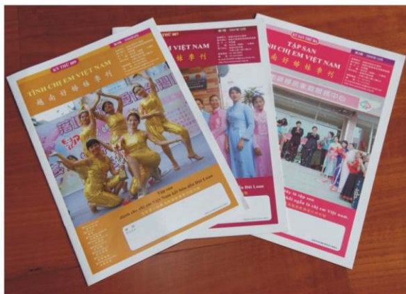
新移民家庭服務中心提供許多外語雜誌 The center provides a variety of foreign and local magazines.