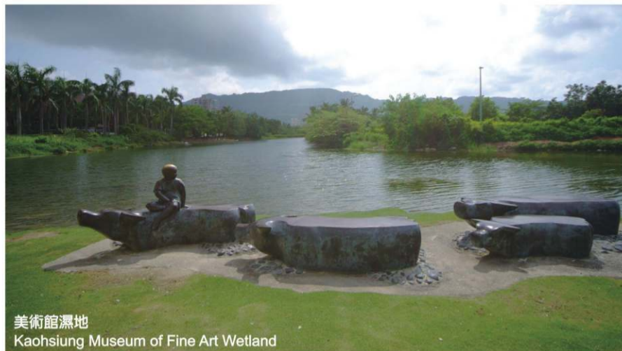
美術館濕地 Kaohsiung Museum of Fine Art Wetland