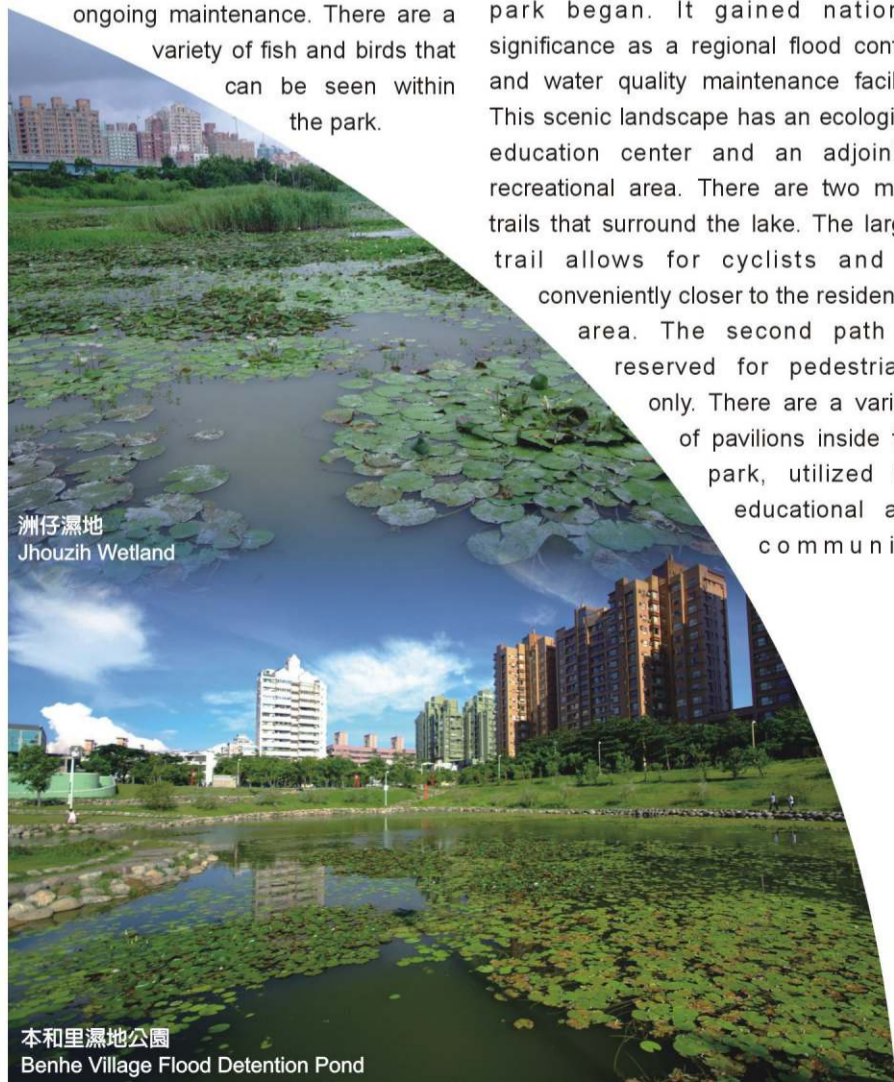
洲仔濕地 Jhouzih Wetland

Yuanjhong Harbor is a 29.41 acre wetland located in the Nanzih District. It is the largest wetland in Kaohsiung, with ecological systems from both fresh water and sea water. In 2007, the former fish farm was transformed into the Yuanjhong Harbor Wetland. The wetland was a result of tidal overflow from the Dianbao River and Taiwan Straits. It is also the last coastal wetland containing a redwood forest and is managed by a partnership of government and private enterprises. Wetlands Taiwan and a volunteer team oversaw the restoration project and its ongoing maintenance. There are a variety of fish and birds that can be seen within the park.