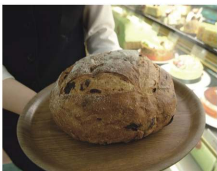
傳奇的「酒釀桂圓麵包」 Award-winning Walnut Longan Bread

On top of establishing a premier culinary brand name, Pasadena has put a lot of effort into establishing an image associated with art and culture. The "Sinwell Gallery" on the 2nd floor of the Pasadena French Restaurant is a space for exhibitions, seminars and contemporary Taiwanese art displays. After savoring delicious French food, the guest can continue their refined cultural experience upstairs. By combining cuisine and art, Kaohsiung's, culinary culture has truly become a multi-sensory experience.