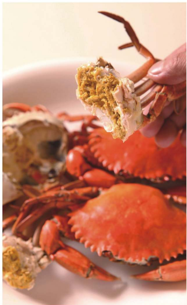
八卦活海鮮 Ba Gua Live Seafood Restaurant

「八卦活海鮮」每日從澎湖、東港、蚵仔寮等地進貨，對海鮮品質嚴格把關，現點現煮，簡單好滋味的台式海鮮，深獲在地人青睞。其中人氣料理「白鯧米粉」，用魚的鮮味和油蔥酥的香氣，配上滑潤順口的米粉，緊緊扣住饕客的胃，已成為「八卦」的鎮店之寶。