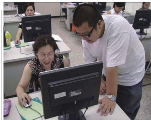
市政府為新移民開設許多課程 The city government sponsors a variety of classes for new immigrants.