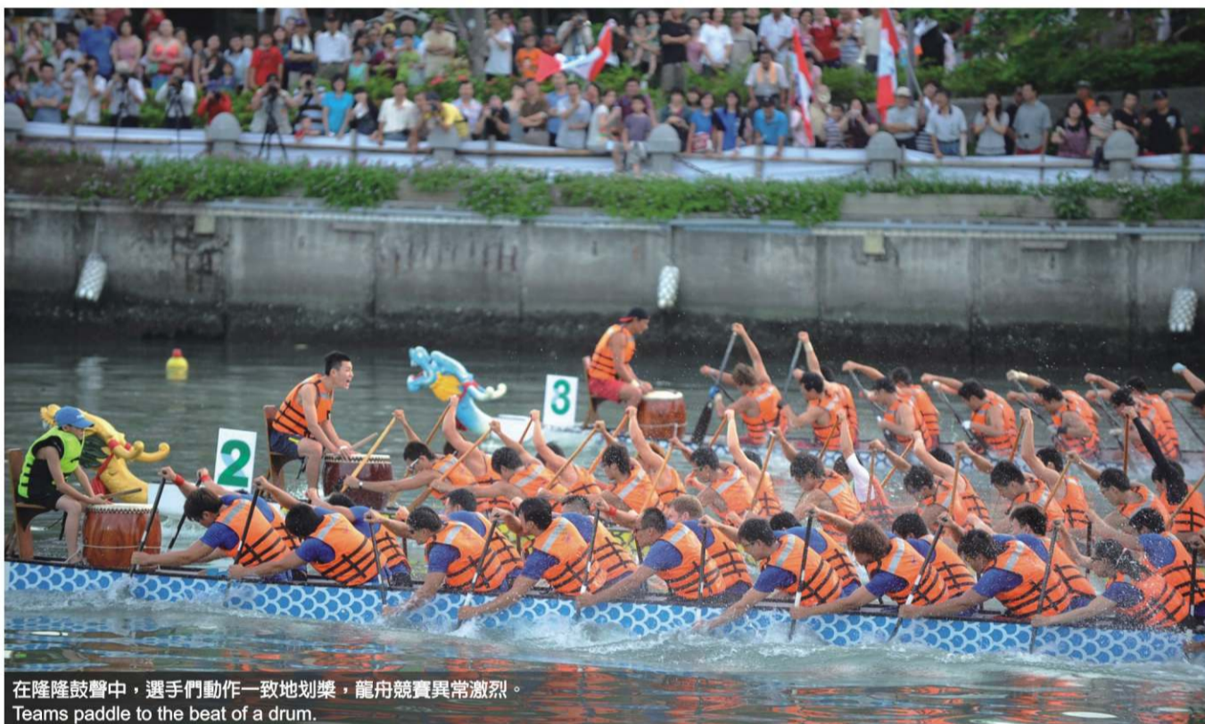
在隆隆鼓聲中，選手們動作一致地划槳，龍舟競賽異常激烈。 Teams paddle to the beat of a drum.

"Fitness Factory" won the Men's Open and took home a