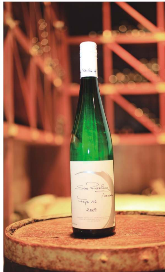
Saar Riesling Trocken

fortified wine tends to develop more complex flavors as it ages. He looks forward to tasting Putao Wine again in the future, to appreciate its richer, fuller effect.