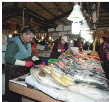
蚵仔寮觀光漁市場 Kezihliao fish Market

Red 70 route runs from Ciaotou Train Station to Ciaotou, Gangshan, Alian, Tianliao and Moon World on the weekends. Red 71 route includes Ciaotou, Gangshan, Lujhu, Hunei and Jiading. Red 72 runs from Ciaotou to Zihguan, Mituo and Yongan. Visitors can take Red 72 to Moon World, Jiading wetlands and Zihguan and Mituo fishing villages.