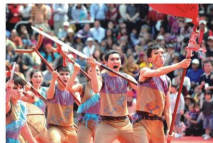
內門宋江陣 Songjiang battle array in Neimen