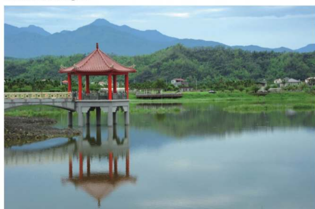
美濃中正湖 Jhong Jheng Lake in Meinong