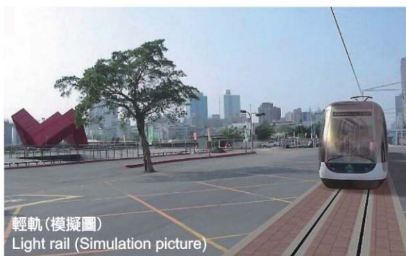
輕軌(模擬圖) Light rail (Simulation picture)

輕軌交通網完成後，成為陸、海、空轉運中心的高雄市，吸引文創、音樂、遊艇、觀光等產業進駐，創造多元就業機會，再造高雄新風貌，使高雄市更具國際競爭力。