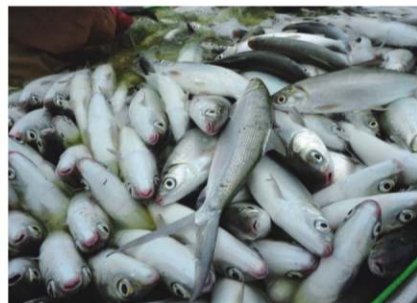
永安虱目魚 Milkfish in Yongan