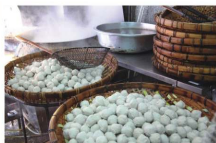
煮魚丸 Fishballs in the boiling water