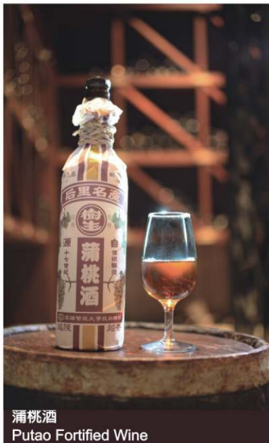
蒲桃酒 Putao Fortified Wine