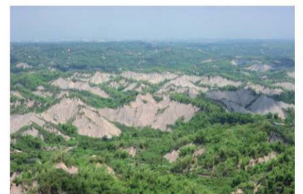
內門308高地 308 High Land in Neimen