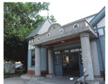
旗山車站 Chishan Old Station

橋頭、梓官、彌陀延伸至永安區，旅人可至田寮區走訪月世界惡地形、或到茄萣沿海一帶欣賞濕地生態，亦或是至梓官和彌陀區，體驗漁村文化。