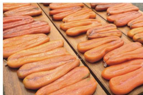
曬烏魚子 Dry Mullet Roes