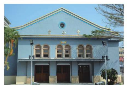
旗山國小 Chishan Elementary School