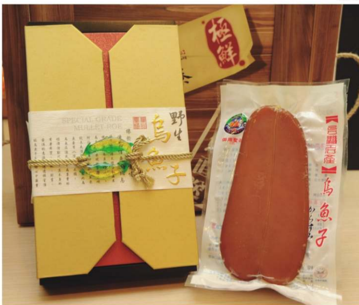
野生烏魚子禮盒 Wild Caught Mullet Roe Gift Box

林園區漁會歷時3年研發出膠原蛋白凍，粹取大片魚鱗、魚骨、魚鰭、鮪魚尾巴和金目鱸魚魚卵等水產產品