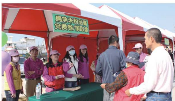
梓官區每年舉辦烏魚文化節，邀請民家品嚐美味烏魚。 Zihguan district holds a Mullet Festival to invite people to taste mullets.