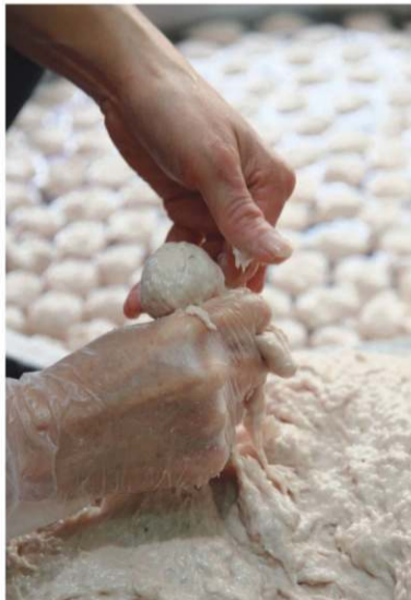
捏魚丸 Shape the fishballs

Sing Yi's owner has adjusted the fish ball recipe several times to meet customers' feedback. The current fish balls are juicy, with a hint of garlic. They have a fine balance of fish flavor and seasoning and have no artificial additives. The chewy texture comes from the vigorous stirring and ice-bathing process.