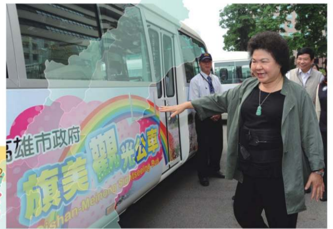
陳菊市長推廣新公車路線 Mayor Chen Chu promoting new bus lines

For a limited time Kaohsiung City Government is offering three MRT shuttle buses. Routes include Red 70, Red 71 and Red 72. This is designed to assist commuters in the greater Gangshan area.